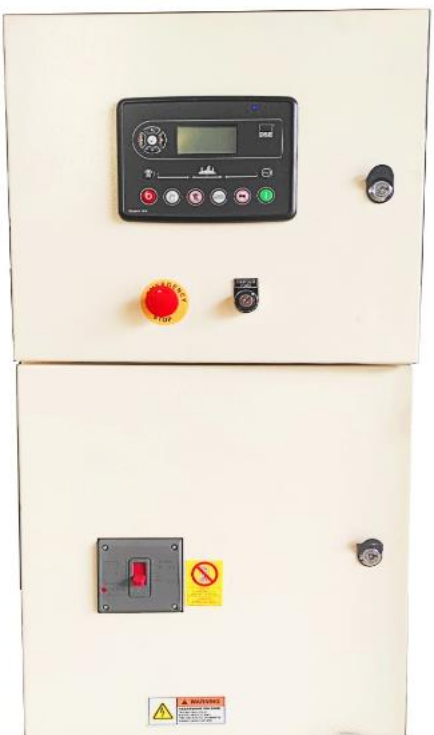
— Deepsea DSE6120